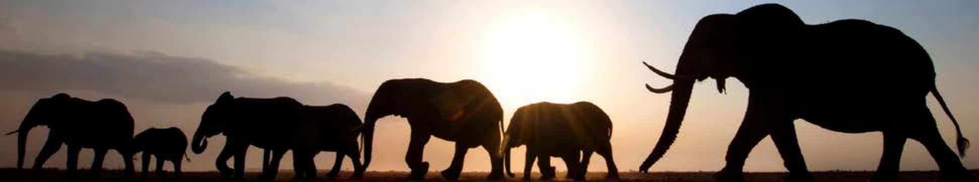
Permanent Luxury Style Example

Tanzania & Kenya offer an array of accommodation types to suit the different needs and wants of travelers, as well as to what best suits the environment that the lodges and camps operate in. Accommodation styles ORYX utilizes are intimate lodges and camps. These include permanent and mobile camps.